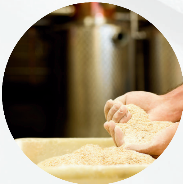
GRAIN BASED DISTILLERIES